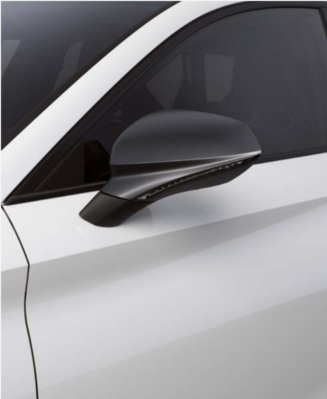
WHITE VZ1 | VZ2 | VZ3