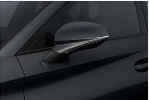
MAGNETIC GREY VZ1 | VZ2 | VZ3 | FIRST EDITION^