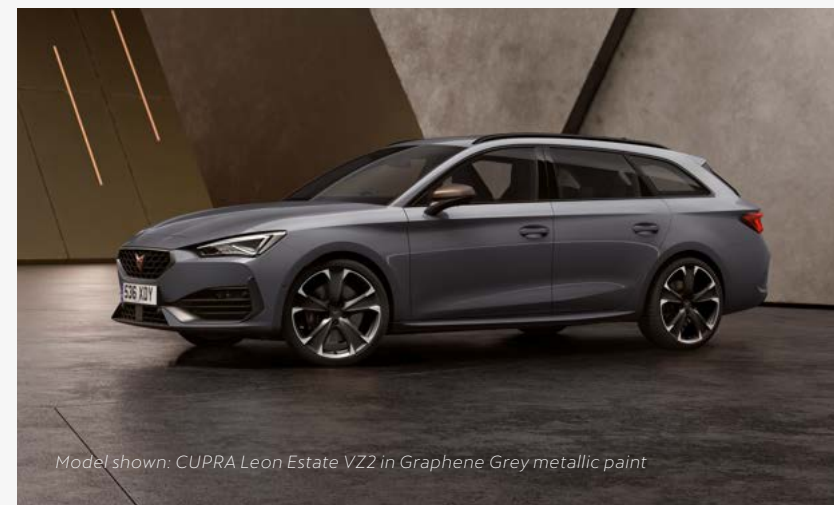
Model shown: CUPRA Leon Estate VZ2 in Graphene Grey metallic paint