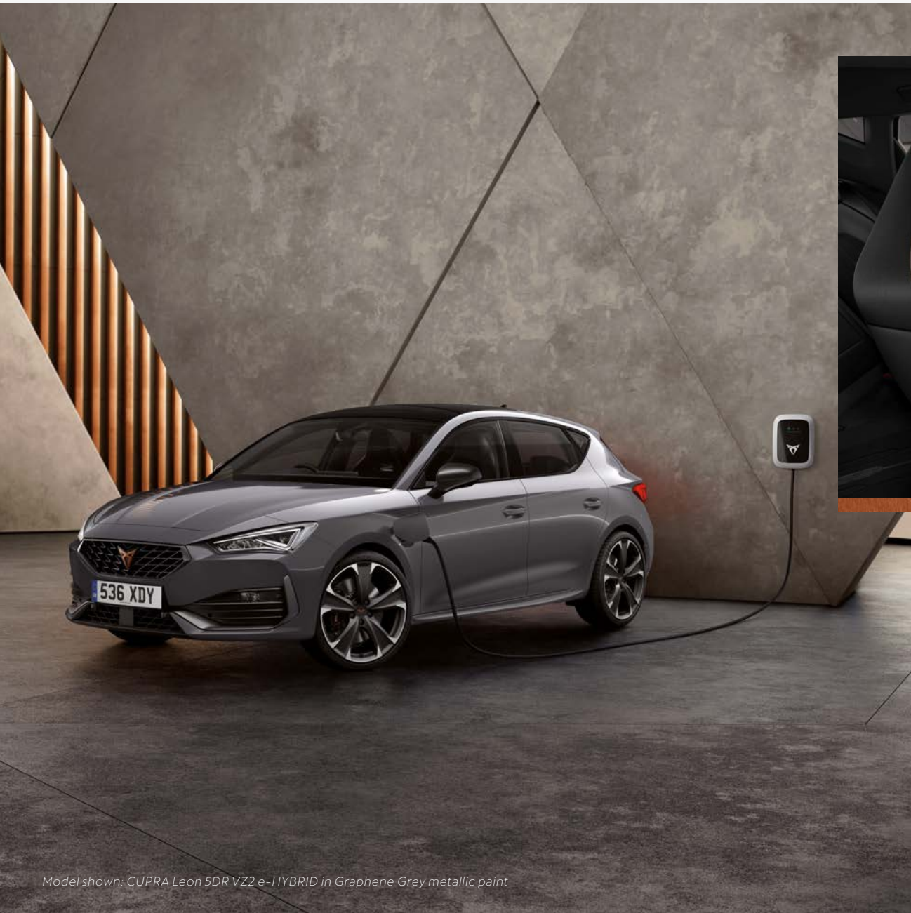
Model shown: CUPRA Leon 5DR VZ2 e-HYBRID in Graphene Grey metallic paint