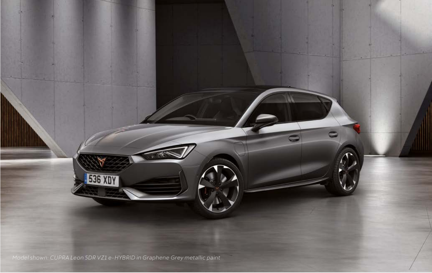
Model shown: CUPRA Leon 5DR VZ1 e-HYBRID in Graphene Grey metallic paint

The CUPRA Connect services can be operated only by using available public communication technologies. Please note that due to development of these technologies, especially mobile networks, CUPRA cannot guarantee consistent availability in all countries for the duration of CUPRA Connect services. Possible changes in technology may cause permanent unavailability of them.