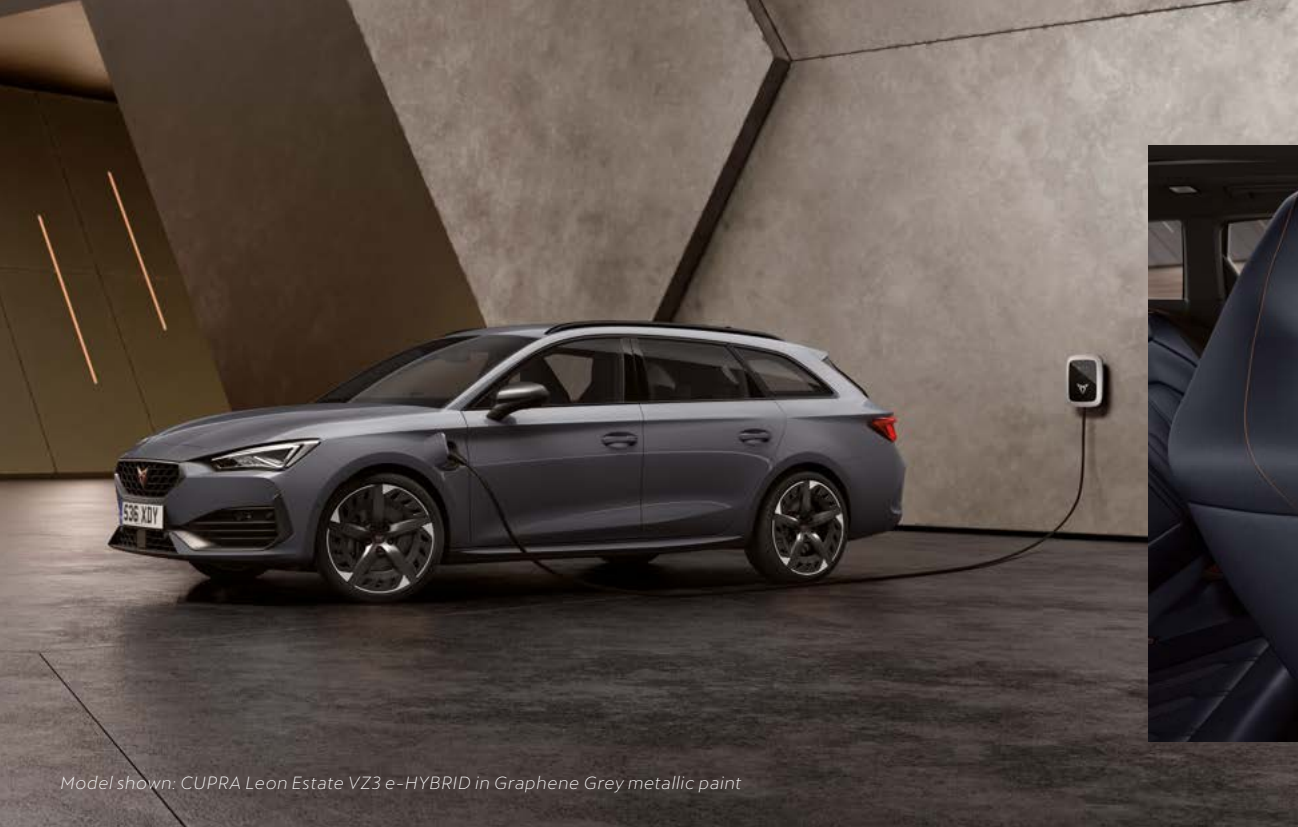
Model shown: CUPRA Leon Estate VZ3 e-HYBRID in Graphene Grey metallic paint