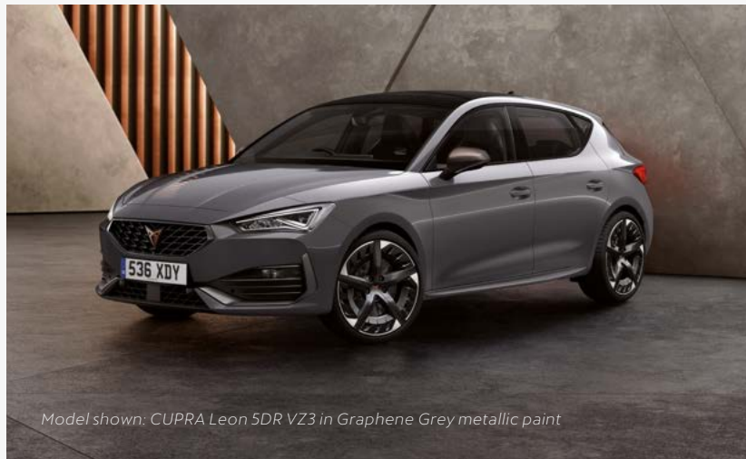
Model shown: CUPRA Leon 5DR VZ3 in Graphene Grey metallic paint