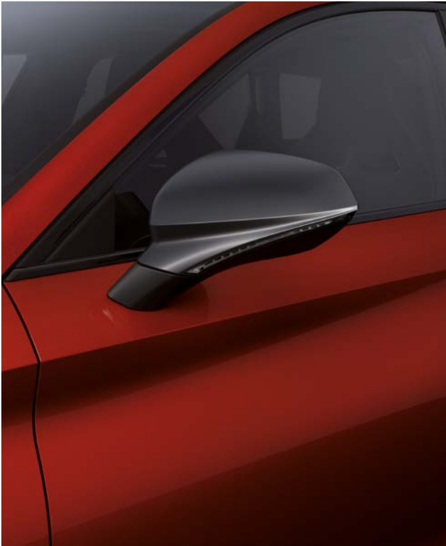
DESIRE RED* VZ1 | VZ2 | VZ3