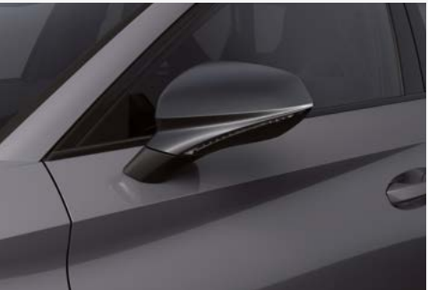
GRAPHENE GREY VZ1 | VZ2 | VZ3 | FIRST EDITION^