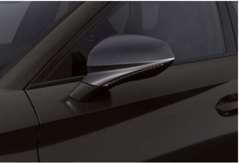
MIDNIGHT BLACK VZ1 | VZ2 | VZ3 | FIRST EDITION^