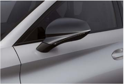
URBAN SILVER VZ1 | VZ2 | VZ3