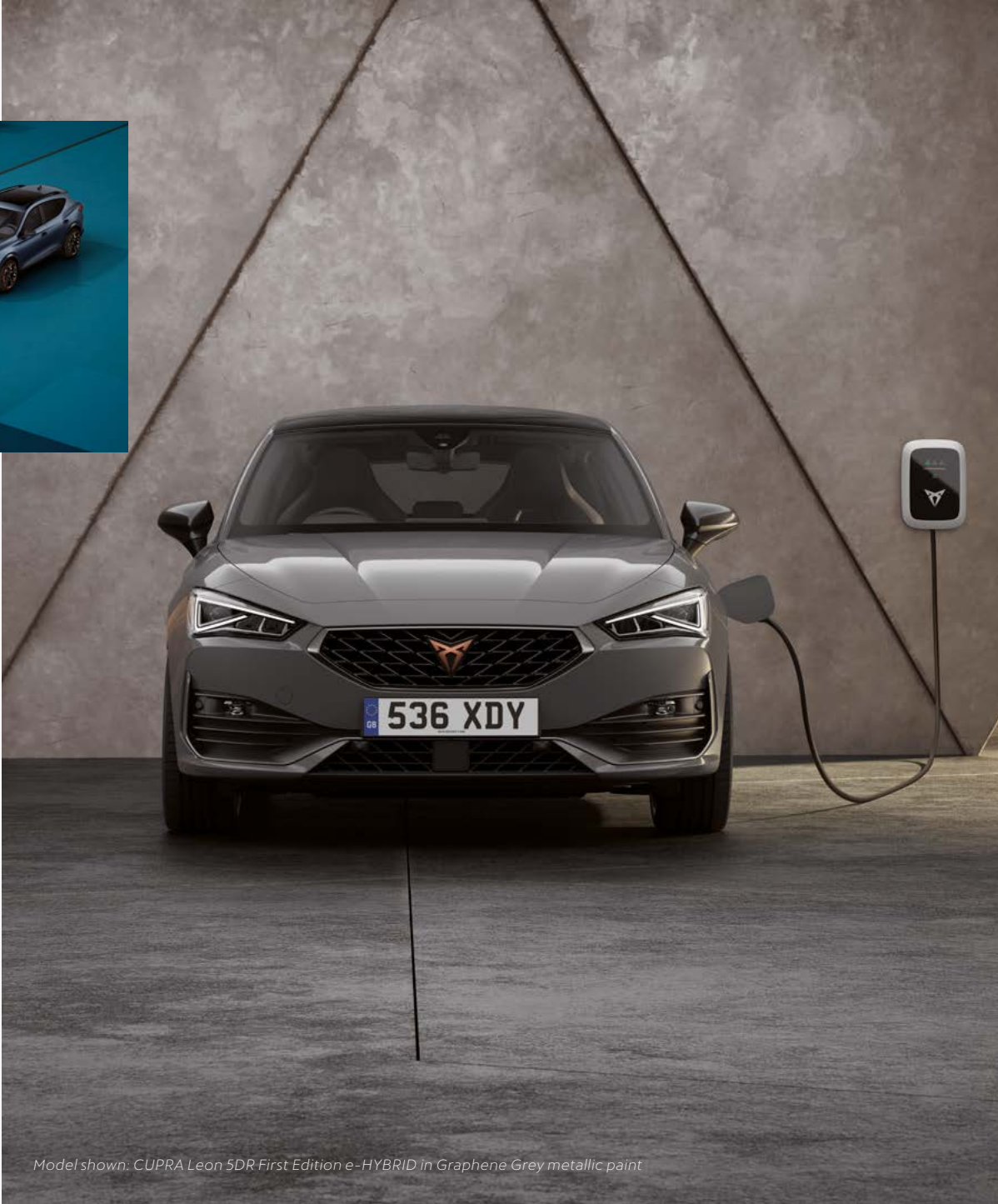
Model shown: CUPRA Leon SDR First Edition e-HYBRID in Graphene Grey metallic paint

Exit Assist warns of approaching traffic from behind and activates a signal in your wing mirrors, helping you to change lanes safely.