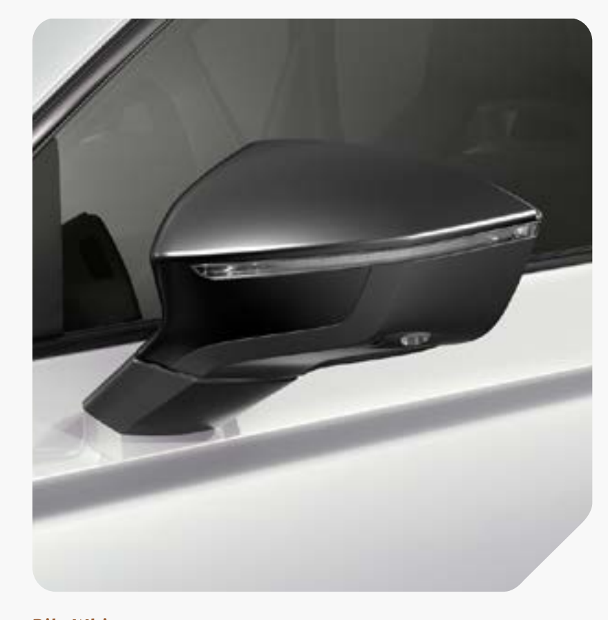
Bila White VZ1 | VZ2 | VZ3