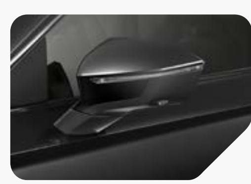
Black Magic VZ1 | VZ2 | VZ3