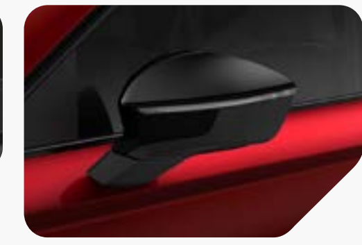
Velvet Red VZ1 | VZ2 | VZ3