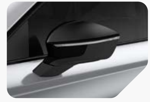
Nevada White VZ1 | VZ2 | VZ3